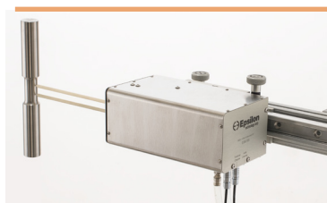
Model 7650A axial extensometer

This high precision extensometer measures axial strains on specimens at temperatures up to 1600 °C (2900 °F). Compatible with materials testing furnaces or induction heating. May be used for strain-controlled, high frequency fatigue tests. Slide mounting system enables mounting to hot specimens in seconds.