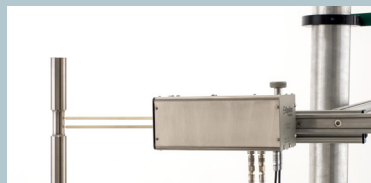
Model 7650A extensometer with rigid load frame mounting

The Model 7650A is often customized for specific test needs. Contact Epsilon for a configuration that matches your requirement.