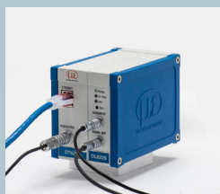
Model DT6229 single-channel signal conditioner provides analog and digital outputs