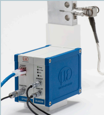
Model 7641 COD gage with signal conditioner