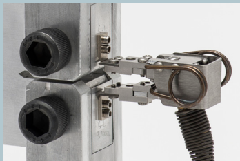
Model 7641 COD gage

See the electronics section of this catalog for available signal conditioners and strain meters.