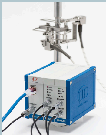
Model 7675 and 7642 with DT6229-02 (dual channel) signal conditioner

The 7675 is supplied with the advanced DT6229 controller. The standard output is 0-10VDC analog signal, factory calibrated with the extensometer. This system provides a number of functional enhancements, including high speed digital output, built in calibration and tare functions, analog and digital filters, and more.