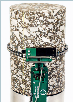
Model 3544-0400 with 1.25 inch to 4 inch diameter range

See the electronics section of this catalog for available signal conditioners and strain meters.