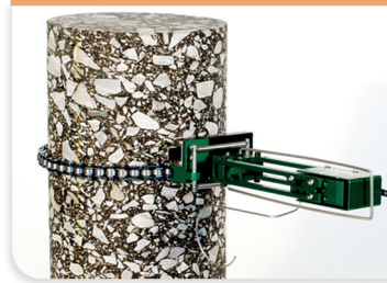
Model 3544 in a horizontal body style

simultaneously with the Model 3542RA axial extensometers.