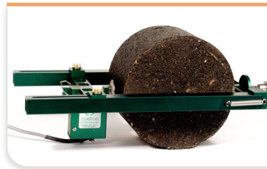
Model 3911 extensometer

For indirect tensile testing, such as for resilient modulus, these extensometers measure the lateral deformation of specimens. They are self-supporting on the sample and clip on in seconds. The traditional way this deformation has been measured was prone to errors caused by slight