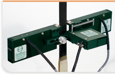
Model 3560 with 25 mm gauge length

A single integral unit provides simultaneous lateral (transverse) strain and averaged axial strain measurement. The unit is also available as an averaged axial extensometer alone.