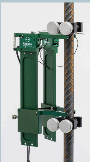
Model 3567 with mounting collars (rebar coupler not shown)