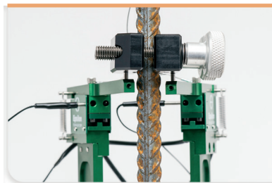
Model 3567 specimen attachment collar with extensometer installed

Extensometers for measuring elongation of rebar coupler, splice, and sleeve assemblies. Use for tension, cyclic, slip, and differential elongation tests.