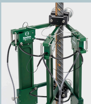
Option for average of three measurements (rebar coupler not shown).

Model 3567 extensometers are strain gaged devices, making them compatible with any electronics designed for strain gaged transducers. Most often they are connected to a test machine controller and Epsilon will equip the extensometer with compatible connectors that are wired to plug directly into the controller. For systems lacking the required electronics, Epsilon can provide a variety of solutions for signal conditioning and connection to data acquisition systems, chart recorders, or other equipment.