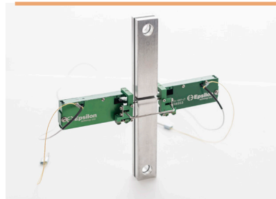
Model 4013 lap shear extensometer

The Model 4013 extensometer meets the requirements of ASTM D5656 for measuring the strain properties of an adhesive in shear. It uses different contact point spacing compared to the extensometer shown in D5656. This makes it much easier to mount and eliminates the slippage problems associated with the design shown in the ASTM standard. The Model 4013 is available with all of Epsilon's temperature configurations. It has a 3.0 mm (0.12 inches) full scale measuring range. The conical point contacts included with the extensometer are made from tungsten carbide.