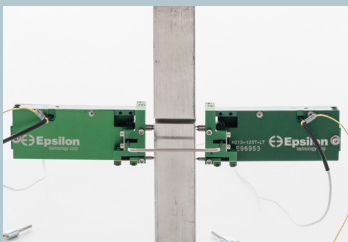
Close-up of the 3 conical contact points used by the Model 4013 extensometer