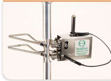
Model 4030 with 0.5 inch gauge length

Submersible extensometer designed for performing tests in water, saline solutions, and other liquids compatible with the materials of construction.