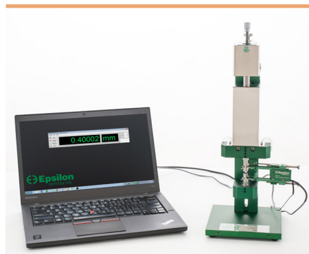
Model 3590VHR calibrator with software (computer optional)

Supplied with ISO 17025 accredited calibration