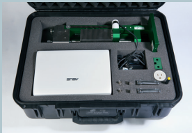
Model 3590VHR calibrator storage case

Supplied with ISO 17025 accredited calibration