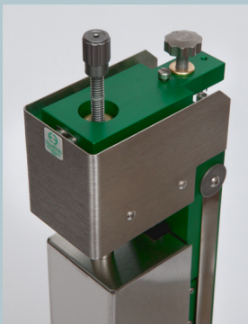
Coarse and fine adjustment knobs for fast and accurate positioning